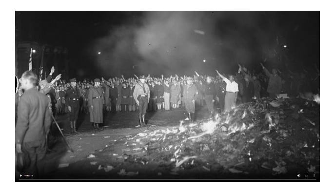
From 1933 onwards, 'non-Aryan' Germans were progressively excluded from the Nazi Volksgemeinschaft (national community) – with the complicity of many Germans.