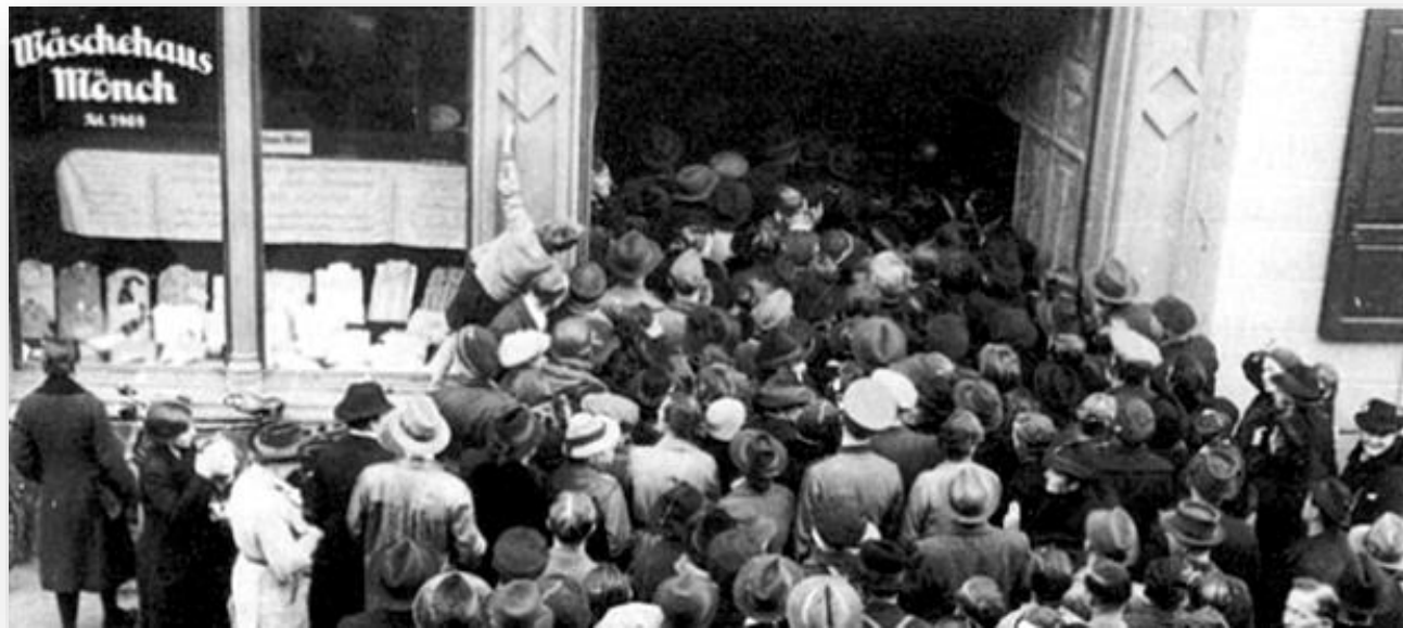
The public sale of Jewish-owned property