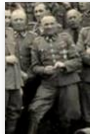
Otto Moll, SS supervisor of the gas chambers and crematoria at Auschwitz- Birkenau