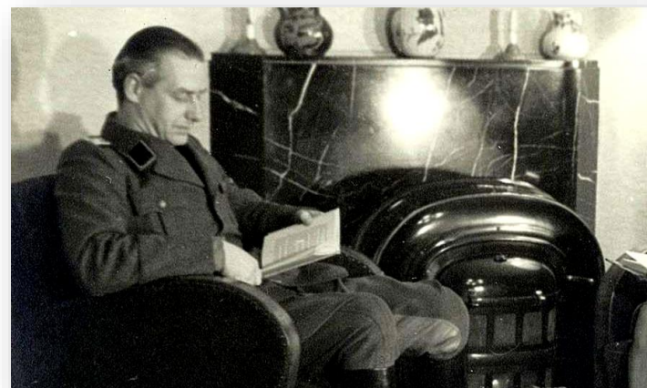
Gemmeker, commandant of Westerbork camp