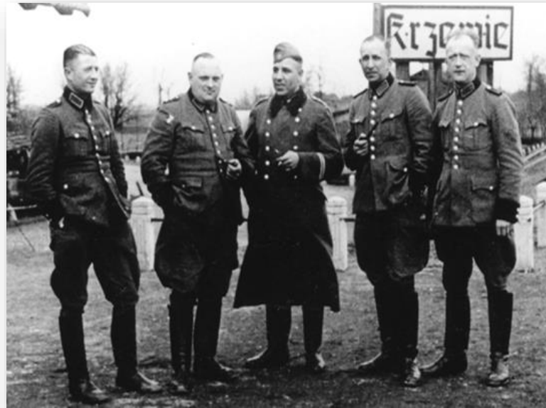
Police Battalion 101, murdered Jewish families