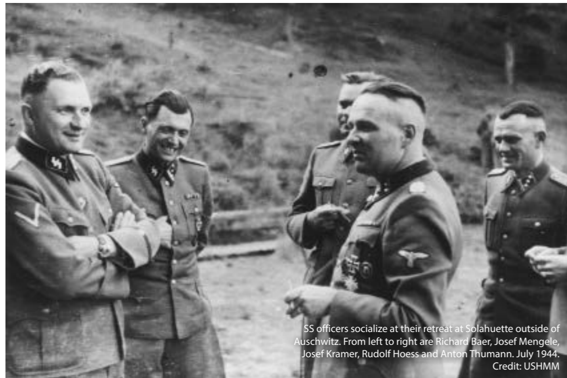
SS officers socialize at their retreat at Solahuette outside of Auschwitz. From left to right are Richard Baer, Josef Mengele, Josef Kramer, Rudolf Hoess and Anton Thumann. July 1944.