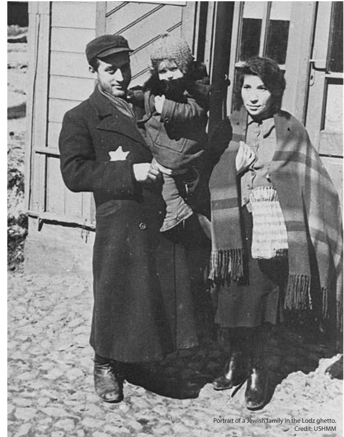
Portrait of a Jewish family in the Lodz ghetto.

In general, the study found that students had a very limited knowledge of the context and wider socioeconomic and political conditions which enabled the Holocaust to unfold in the manner that it did. Only a limited number of students tried to explain the Holocaust by looking at its immediate historical context and these explanations were mainly framed with reference to Germany's economic downturn and the loss of the First World War.